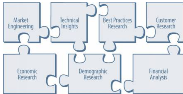
Chart 3: Benchmarking Performance with TEAM Research

evaluation platform for benchmarking industry players and for creating high-potential growth strategies for our clients.