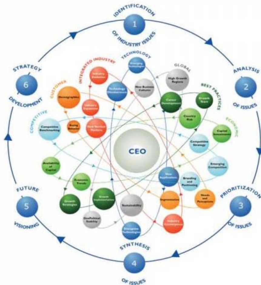
Chart 2: The CEO's 360 Degree Perspective™ Model Directs Our Research

growth strategies. As illustrated in Chart 5 below, the following six-step process outlines how our researchers and consultants embed the CEO 360 Degree Perspective™ into their analyses and recommendations.